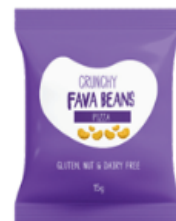
Roasted fava beans

For more ideas and recipes, visit www.swapit.net.au/recipes