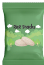
Mini rice wheels